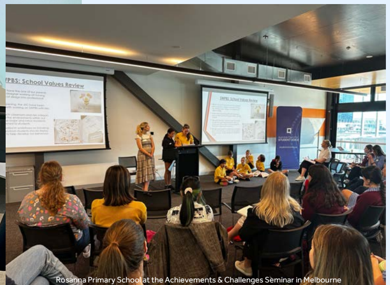
Rosanna Primary School at the Achievements & Challenges Seminar in Melbourne