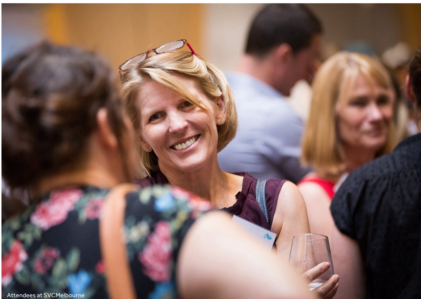
Attendees at SVMelbourne

The project will be overseen by a steering committee comprising representatives from key stakeholder groups, responsible for providing guidance, decision-making, and oversight throughout the project lifecycle.